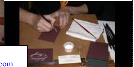
Calligraphy demonstration by the Washington Calligraphy Club ( Calligraphersguild.com )